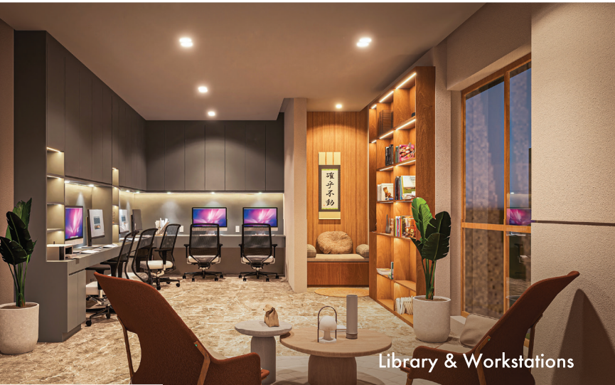
Library & Workstations