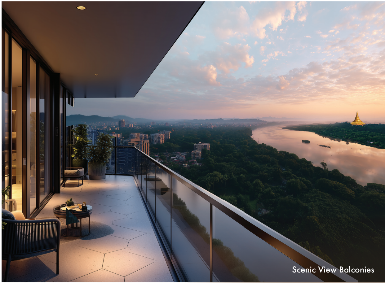
Scenic View Balconies