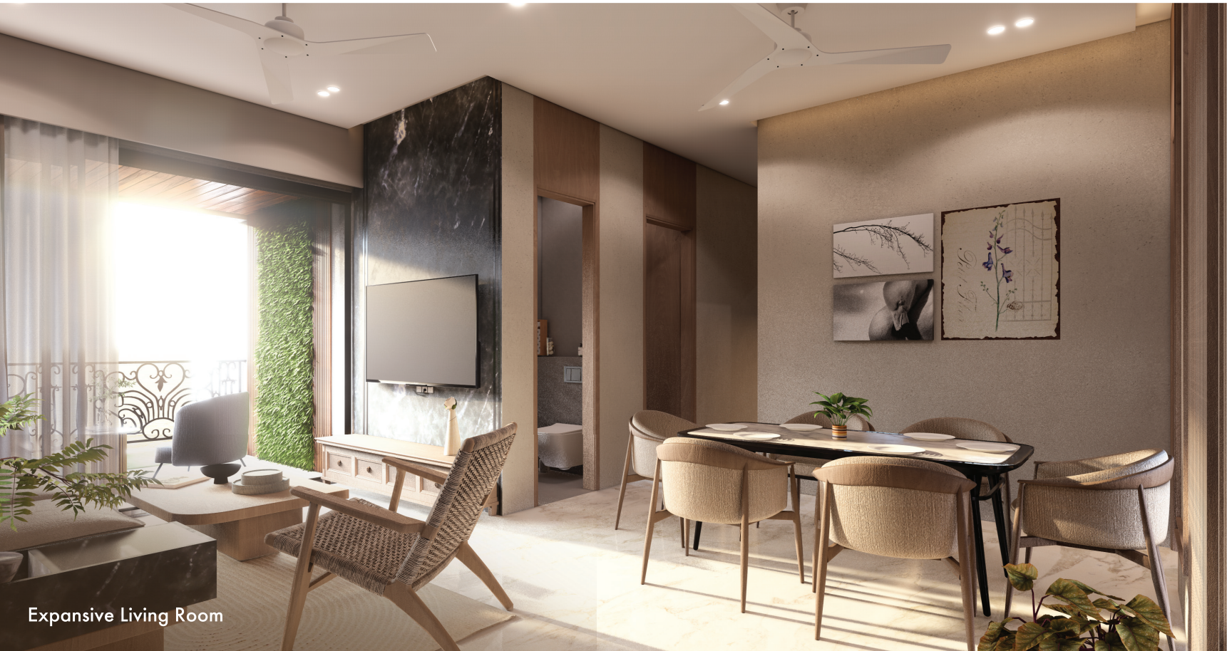
Expansive Living Room