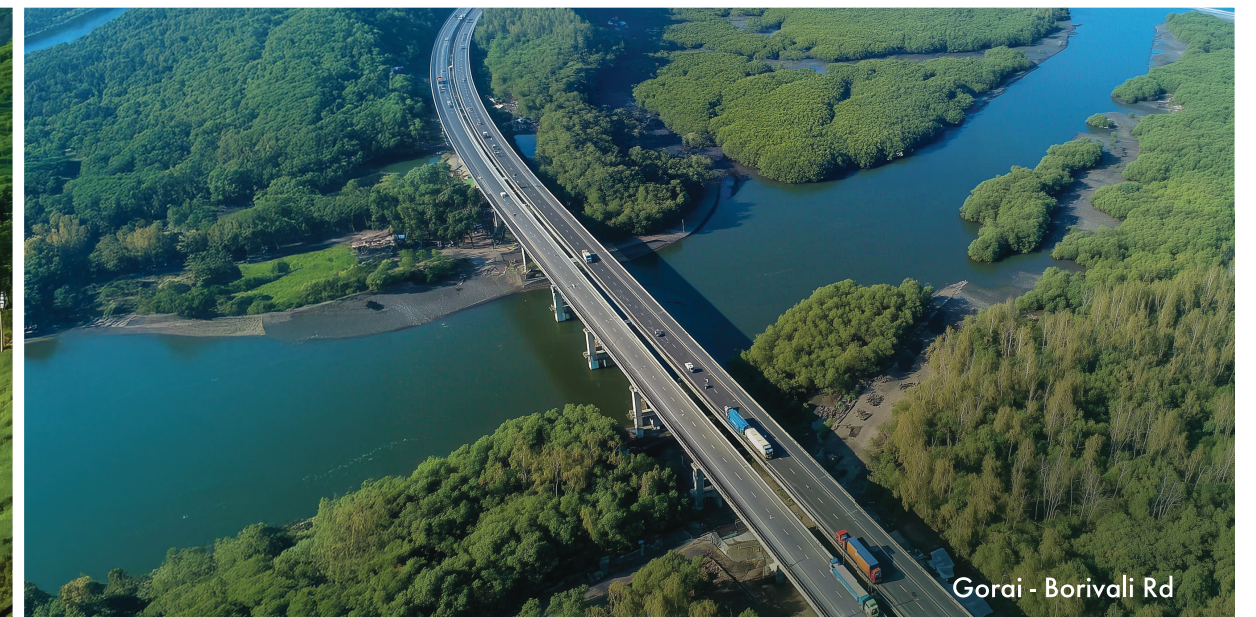
Gorai - Borivali Rd