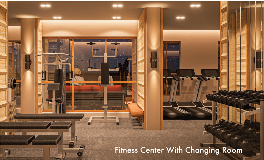
Fitness Center With Changing Room