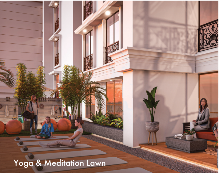
Yoga & Meditation Lawn