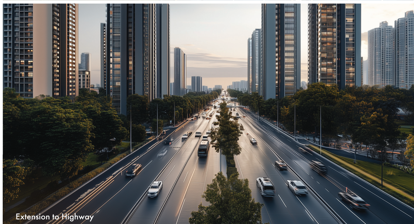
Extension to Highway