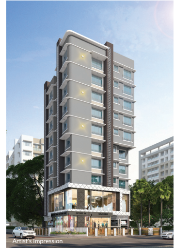
RISHABRAJ MONALISA - Borivali W