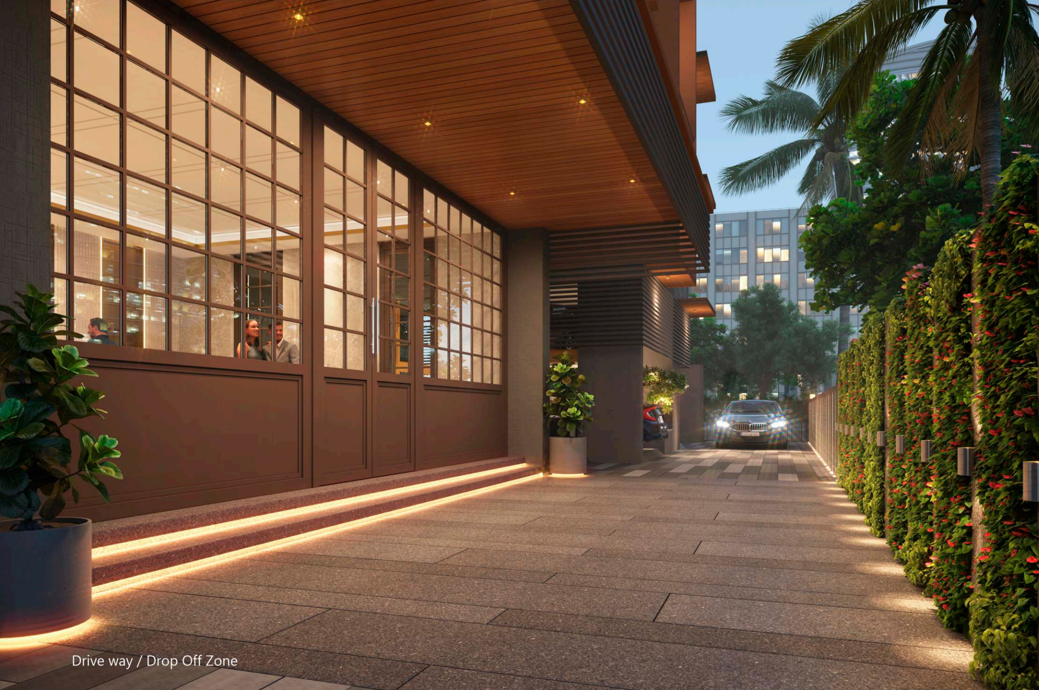
Drive way / Drop Off Zone