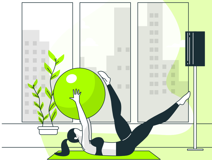
STATE OF THE ART GYM