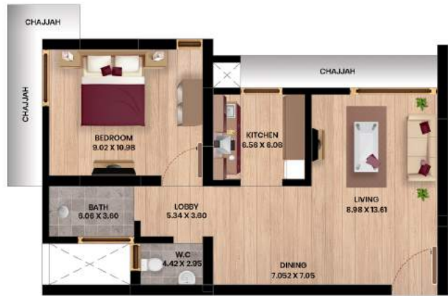
■ 1 BHK (392 SQ FT)